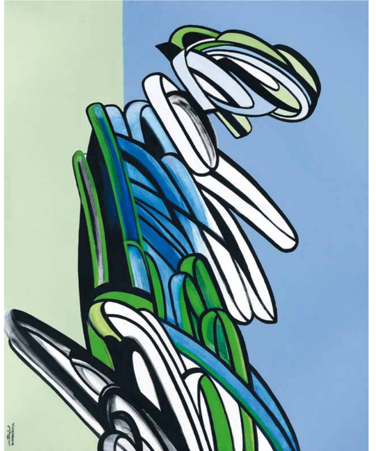
Figure, 2011 Acrylic on canvas - 160 x 130 cm - 63 x 51.2 in.