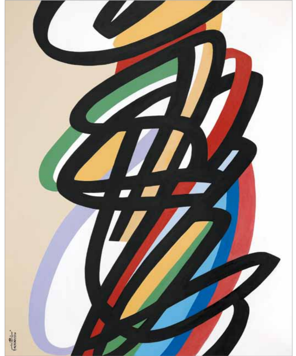
Untitled, 2011 Acrylic on canvas - 160 x 130 cm - 63 x 51.2 in.