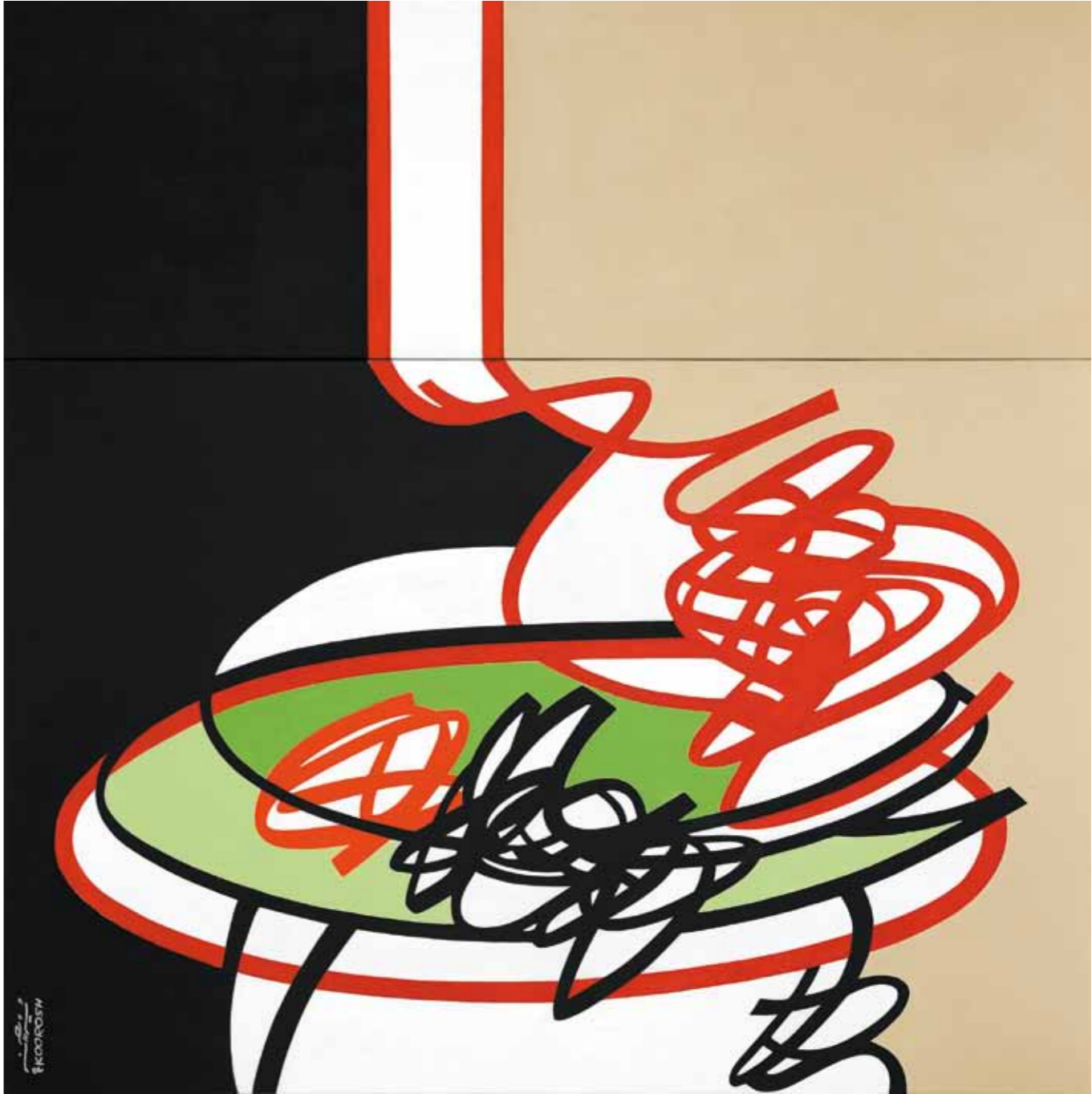
Untitled, 2011 Acrylic on canvas - Diptych: 134 x 134 cm - 52.8 x 52.8 in.