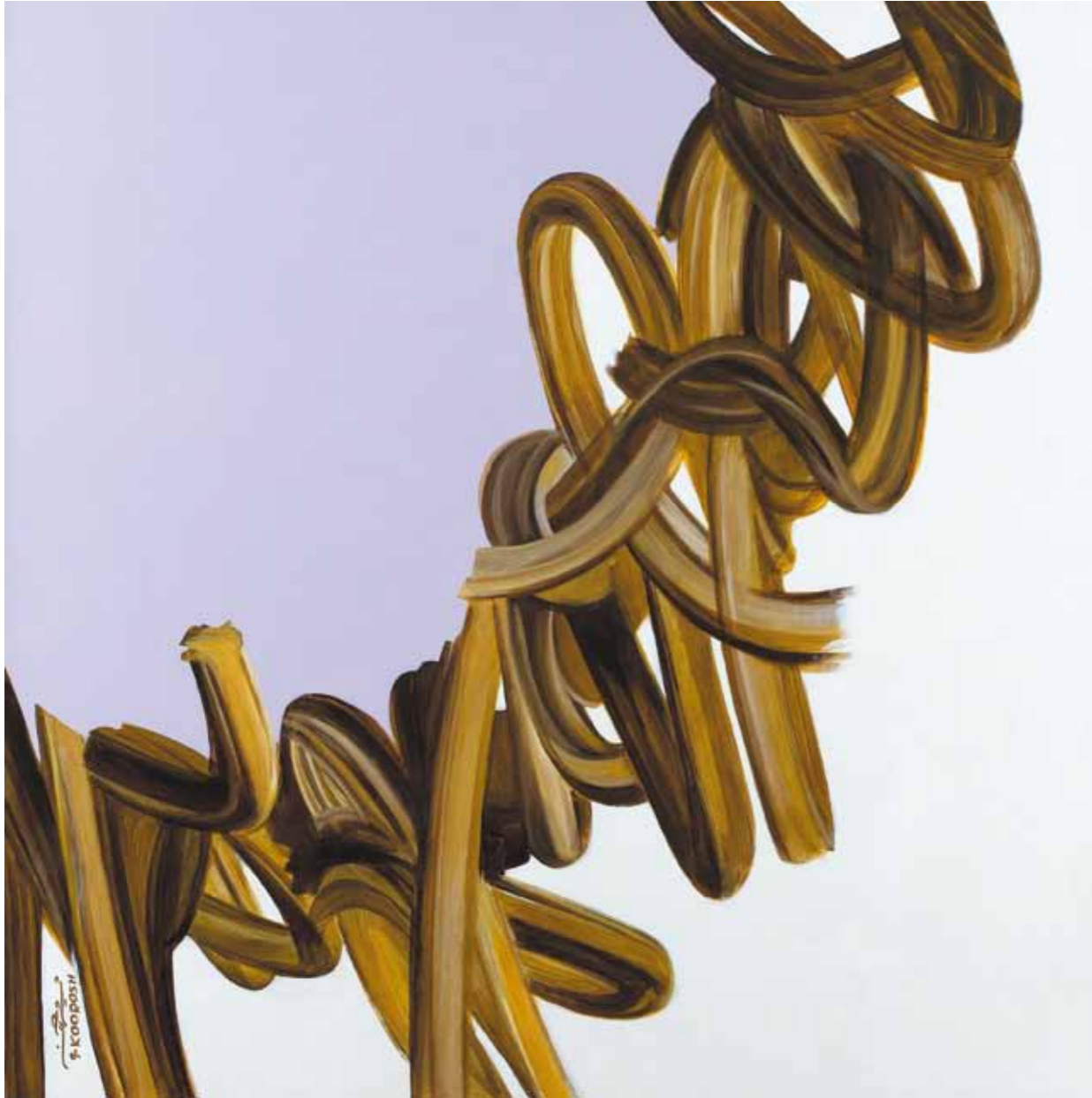
Untitled, 2011 Acrylic on canvas - 130 x 130 cm - 51.2 x 51.2 in.