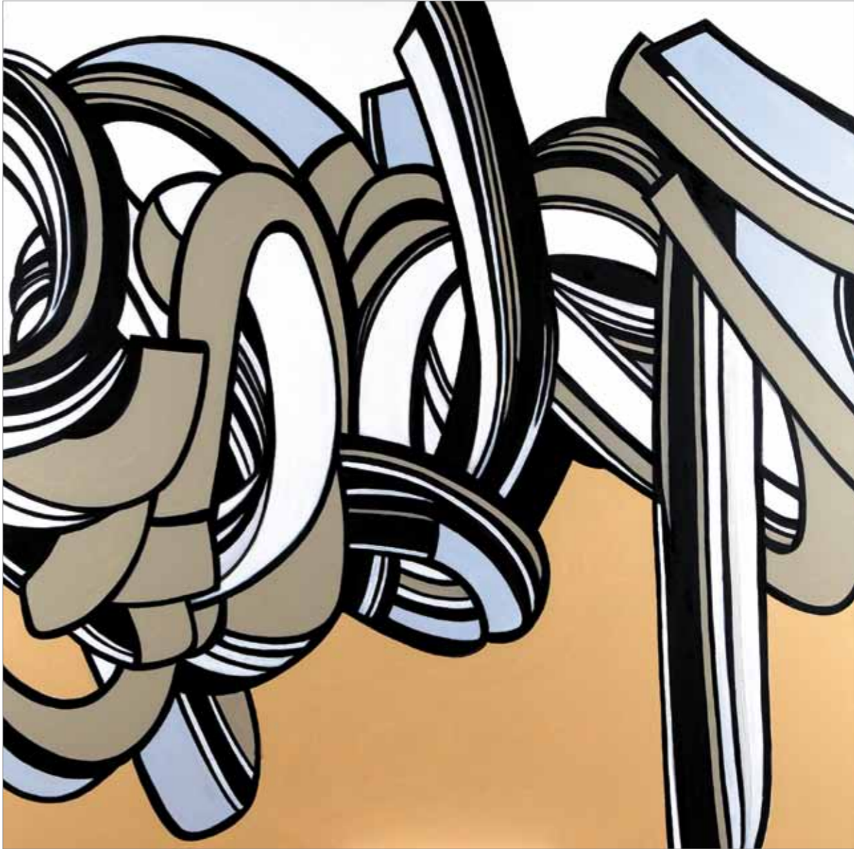
Untitled, 2011 Acrylic on canvas - 120 x 120 cm - 47.2 x 47.2 in.