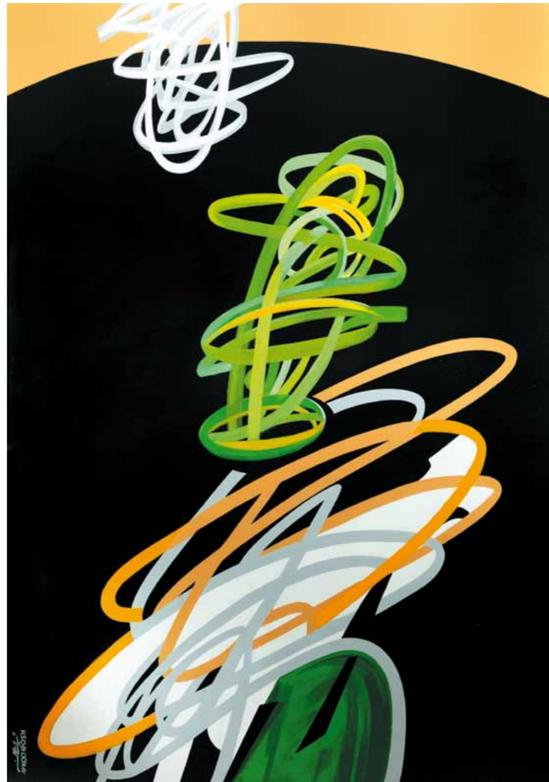
Green head, 2009 Acrylic on canvas - 170 x 120 cm - 66.9 x 47.2 in.