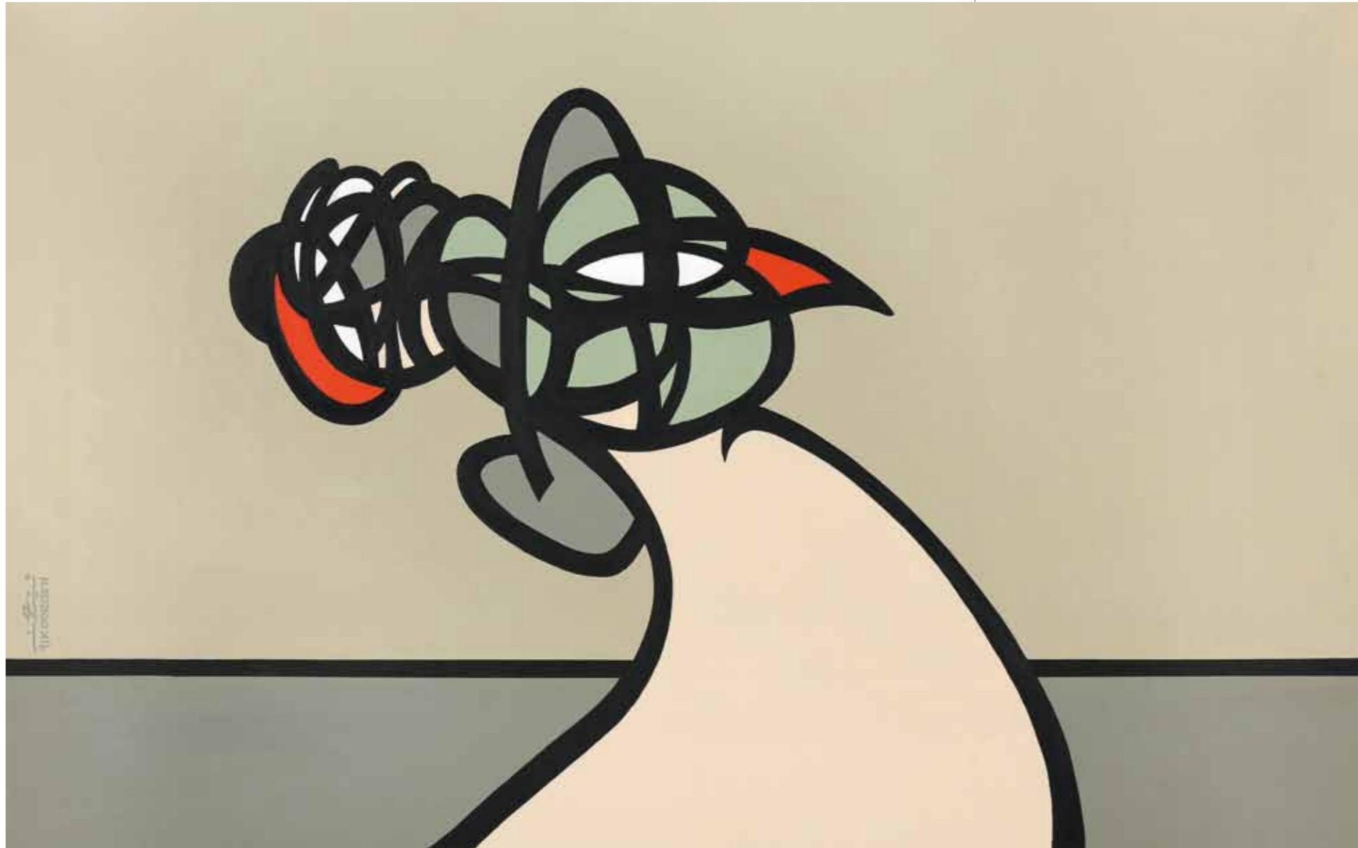
The bird, 2012 Acrylic on canvas - 100 x 160 cm - 39.4 x 63 in.